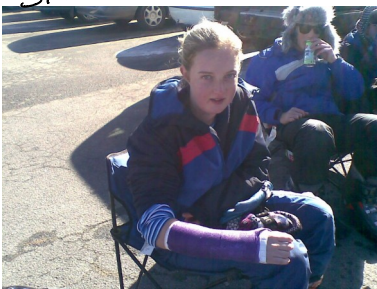
And in the words of her father... "stupid here now has a broken arm"